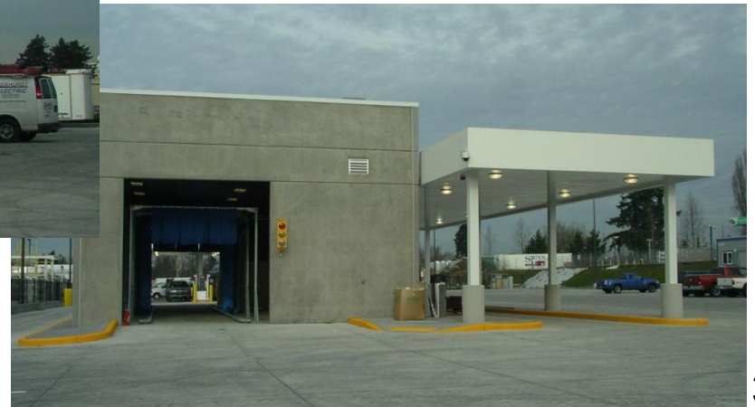
Bus Wash Facility