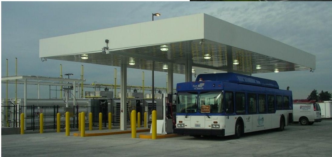
CNG Fueling Facility