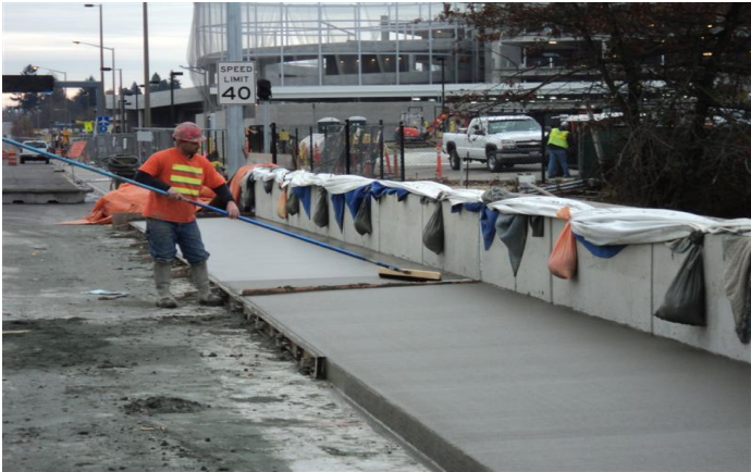
SR 999 Bridge sidewalk finishing