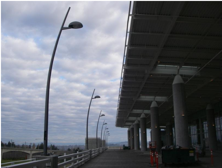
RCF CSB Approach – New Fixtures