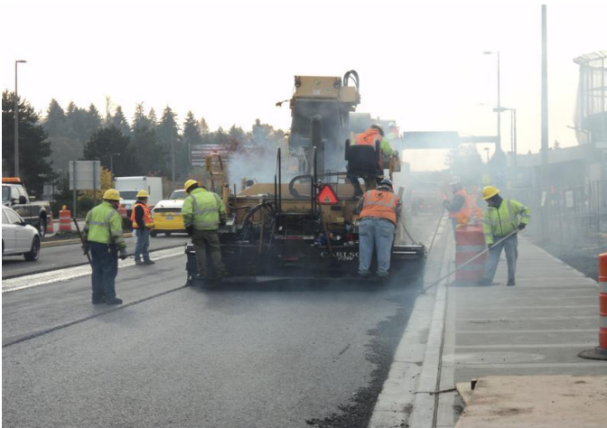
Paving new lane on International Blvd