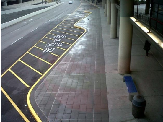
Sidewalk and Shuttle Stop Improvements