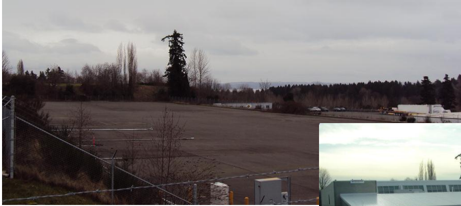
Site at start of construction