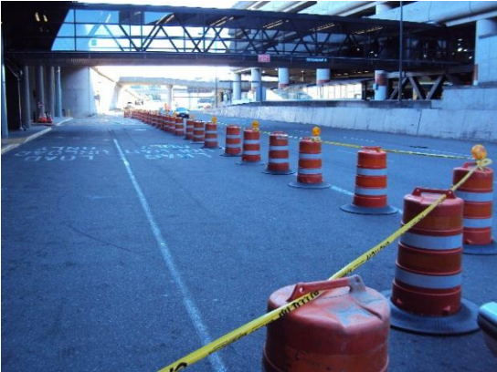
Start of construction